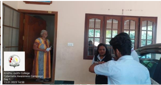
Kristu Jyoti College CyberNetix Awareness Campaign Day 1 13.01.2023 14:58