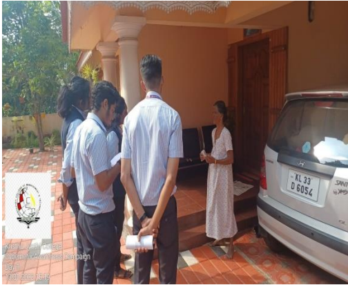
Kristu Jyoti College CyberNetix Awareness Campaign Day 1 13.01.2023 14:55