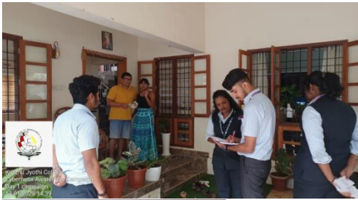
Kristu Jyoti College CyberNetix Awareness Campaign Day 1 13.01.2023 14:52