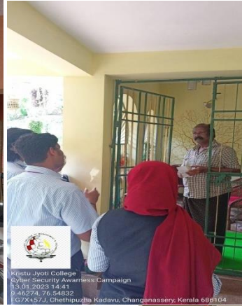
Kristu Jyoti College Cyber Security Awareness Campaign 13.01.2023 14:41 P-46274, 76-54832 FG7Xs-7J, Chethipuzha Kadavu, Changanassery, Kerala 686104