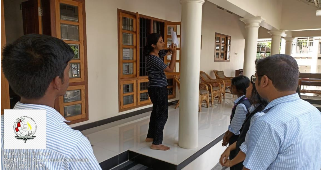
Kristu Jyoti College CYBERNETIX Awareness Campaign 16.01.2023 14:57