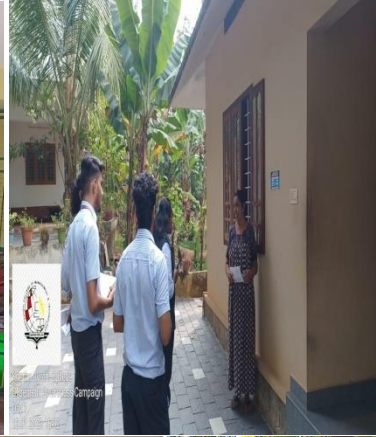
Kristu Jyoti College Cyber Security Awareness Campaign 13.01.2023 14:41