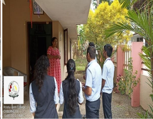
Kristu Jyoti College CYBERNETIX 13.01.2023 14:55