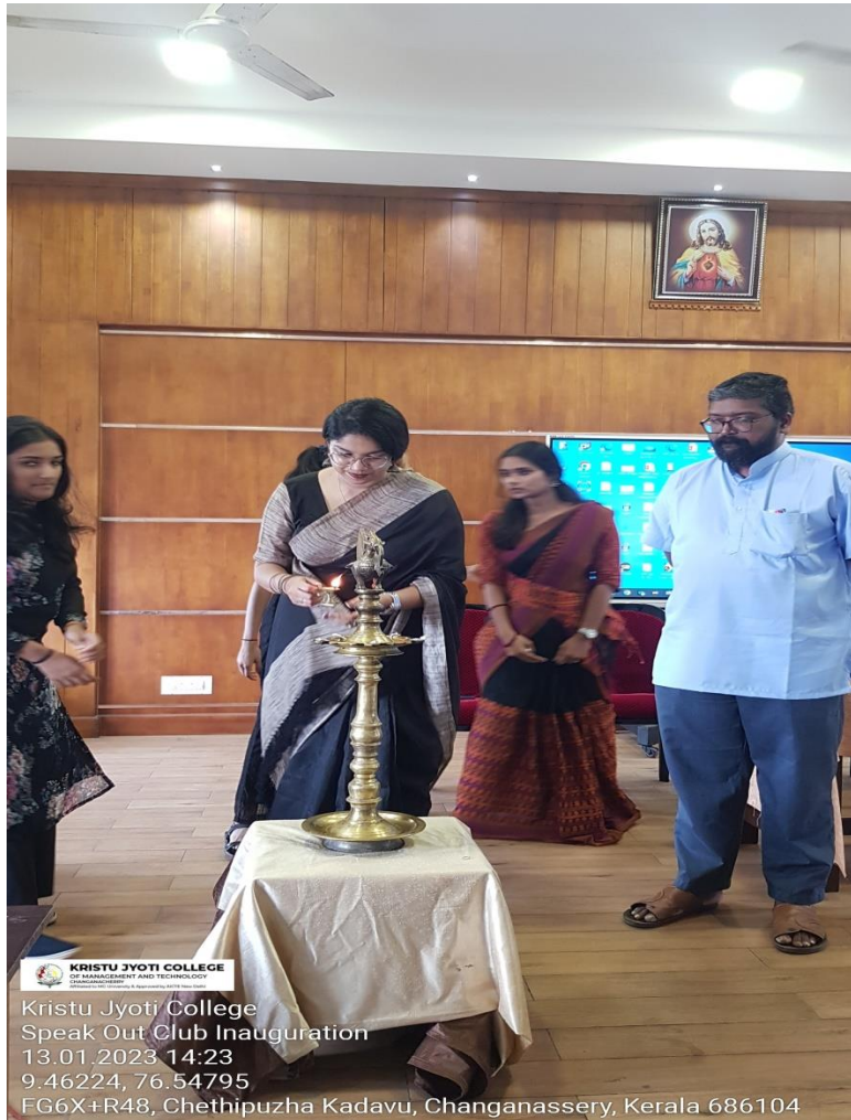
KRISTU JYOTI COLLEGE OF MANAGEMENT AND TECHNOLOGY CHETHIPUZHA KADAVU, CHANGANASSERY, KERALA Kristu Jyoti College Speak Out Club Inauguration 13.01.2023 14:23 9.46224, 76.54795 FG6X+R48, Chethipuzha Kadavu, Changanassery, Kerala 686104