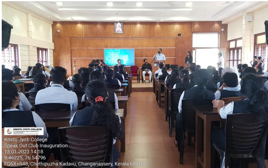
KRISTU JYOTI COLLEGE OF MANAGEMENT AND TECHNOLOGY CHETHIPUZHA KADAVU, CHANGANASSERY, KERALA Kristu Jyoti College Speak Out Club Inauguration 13.01.2023 14:18 9.46225, 76.54796 FG6X+R48, Chethipuzha Kadavu, Changanassery, Kerala 686104